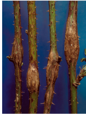
Figure 18. Swelling on blackberry canes caused by rednecked cane borers

Rednecked cane borer: Red-necked cane borer larvae are white, slender, legless, and about ½ to ¾ inch long when fully grown. The larvae tunnel in the primocanes (first-year canes), causing the bark to split and the cane to swell at the initial feeding site (Fig. 18). These swollen areas ( galls ) can measure about ½ inch thick and several inches long. Most of these swollen areas occur just above the soil surface but some may be found anywhere on the primocane. Infested canes die or fail to produce.