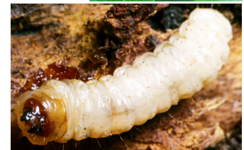
Figure 11. Peach tree borer adult (top) and larva

prevent reinfestation if you apply it to the bark before small larvae tunnel into the tree.