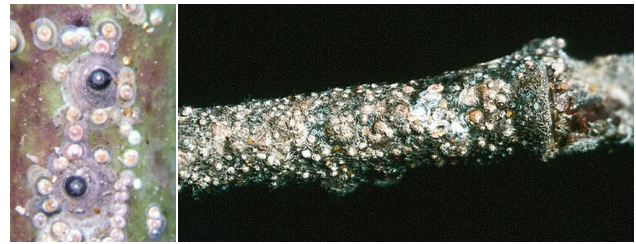
Figure 8. San Jose scales (left) and a branch infested with them

San Jose scale: San Jose scales (Fig. 8) are tiny insects that feed on fruit and cause reddish-purple blemishes on it. They feed primarily on small twigs and branches (discussion below).