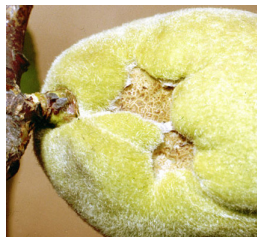
Figure 4. Catfacing damage by plant bugs

spring and summer. To eliminate this source of infestation, collect and destroy fallen fruit often. If plum curculio is present in your orchard, apply an effective insecticide (Table 2) at shuck-split, and make the second and third applications at 10- to 14-day intervals and about 30 days before harvest. For plums and nectarines, you may need to begin these treatments at 90 percent petal fall. These scheduled treatments are necessary to kill the adults before they can feed on and deposit eggs in the fruit.