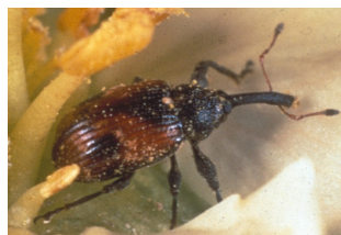
Figure 19. Strawberry bud weevil

Strawberry clipper or strawberry bud weevil: The adult is a tiny, dark brown snout weevil about ¼ inch long (Fig 19). The female weevil deposits eggs in the flower buds of blackberries and strawberries when they first begin to swell in the spring. It then girdles or clips the stem of the flower bud, which causes the bud to break over and soon fall to the ground, reducing yields. Look for weevils by beating the bud clusters onto a white paper plate. If you see weevils or newly clipped buds, apply an insecticide to kill the weevils.