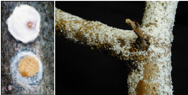
Figure 10. White peach scales

White peach scales (Fig. 10) feed on peaches and many woody ornamentals. The covers of female scales are round and white. Male scales are white and elongate—masses of them give twigs a fluffy appearance.