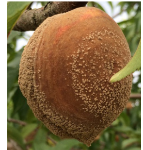
Figure 14. Brown rot

Under heavy infection, sunken lesions (abnormal tissue growths) can develop, and the skin may crack, allowing other pathogens, such as brown