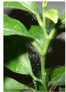
Figure 20. Spider mite infestation and webbing

Spider mites: Spider mites are tiny mites that feed on the underside of leaves, producing a fine webbing (Fig. 20) and causing the leaves to discolor, eventually die, and drop. The mites increase on water-stressed plants during hot, dry weather. Infestations may increase when broad-spectrum insecticides are applied often. Several applications of an insecticidal soap (such as Safer Insect Killing Concentrate, Table 2) can suppress mite infestations. Because soaps kill by contact, the spray must be applied to the underside of leaves, where the mites feed.