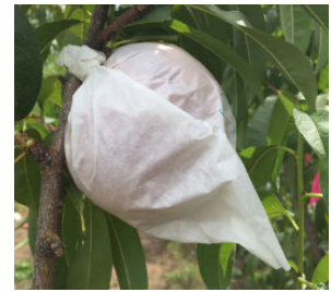
Figure 1. Peach protected from insect and disease pests by a paper bag that also allows the airflow and light needed for normal fruit development

by brown rot fungi, plum curculio, and other insect pests while allowing the airflow and light needed for normal fruit development. As a result, bagging reduces the need for pesticides. Fruit bags can be purchased from Clemson University at https://tinyurl.com/Clemson-fruit-bags .