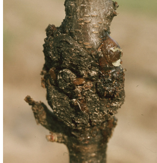
Figure 12. Lesser peach tree borer adult (top) and damage

In contrast, cankers are elongated depressions that form at the base of dead buds. A clear gum, free of woodchips, can exude from these cankers. Removing the bark above a canker reveals a brown margin separating the diseased area and healthy wood.