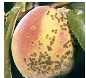
Figure 15. Peach scab