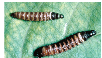
Figure 9. Peach twig borer

Peach twig borer: Larvae of the peach twig borer (Fig. 9) feed inside peach and plum fruit. The full-grown larva is about ½ inch long and has alternating bands of light and dark brown. The head is black, and six legs are clearly visible. The larvae push excrement ( frass ) from their tunnels onto the surface of the fruit, where it is readily visible. See the borer section for control information.