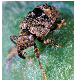
Figure 3. Plum curculio larva (top) and adult