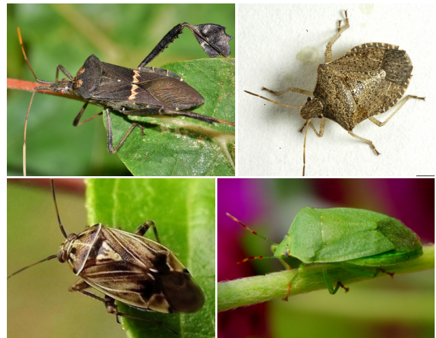
Figure 5. Clockwise from top left: leaffooted bug, brown stinkbug, southern green stinkbug, and lygus bug

spring and summer. To eliminate this source of infestation, collect and destroy fallen fruit often. If plum curculio is present in your orchard, apply an effective insecticide (Table 2) at shuck-split, and make the second and third applications at 10- to 14-day intervals and about 30 days before harvest. For plums and nectarines, you may need to begin these treatments at 90 percent petal fall. These scheduled treatments are necessary to kill the adults before they can feed on and deposit eggs in the fruit.