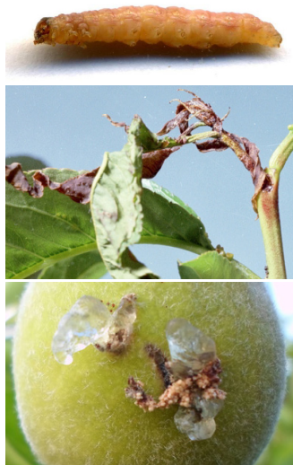
Figure 6. Oriental fruit moth larva (from top), shoot damage (flagging) caused by larvae feeding in the shoot, and damage by a larva feeding on a peach

Full-grown larvae are pinkish, have a brown head, and are about ½ inch long. Unlike plum curculio larvae, they have distinct legs and crawl quickly when disturbed. To reduce infestations, apply insecticides at shuck-split and reapply them 2 weeks later.