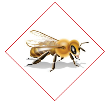
Figure 2: Icon on pesticide labels indicating the steps to protect bees and other pollinators

Fruit production requires pollination by honeybees and other insects. Insecticides can pose risks to these beneficial insects if used improperly. Do not apply insecticides to plants when flowers are present. Apply insecticides late in the evening or at night when bees are not foraging. For directions and restrictions on protecting bees and other insect pollinators, read the bee advisory box, highlighted by the bee icon, on the product label (Fig. 2).