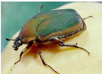
Figure 7. Green June beetle

Green June beetles, grasshoppers: The green June beetle (Fig. 7) is a large, metallic green beetle that feeds on ripening peaches, pears, plums, grapes, and other thin-skinned fruit just before harvest. Green June beetles, commonly found in pastures and hay-fields, develop as grubs that feed on decomposing manure and organic matter.