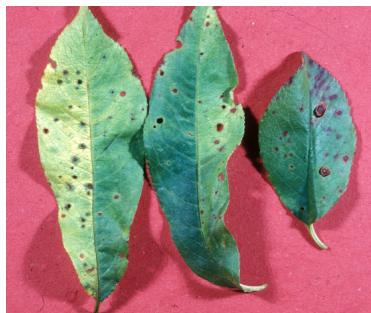
Figure 16. Bacterial spot symptoms

Bacterial spot: Bacterial spot infects stems, leaves (Fig. 16), and fruit. Symptoms on leaves appear first as small, pale green lesions that are circular or irregularly shaped. During early development, the lesions are often concentrated near the leaf tip. In advanced stages, the inner part of the lesion falls out, giving the leaf a ragged or “shot hole” appearance. Heavily infected leaves often turn yellow and drop. On the fruit, the symptoms appear first as small, circular, olive brown spots. As the bacteria develop, the spots darken and sink slightly. The lesions scatter over the fruit surface, and tiny cracks develop in the center of the spots.