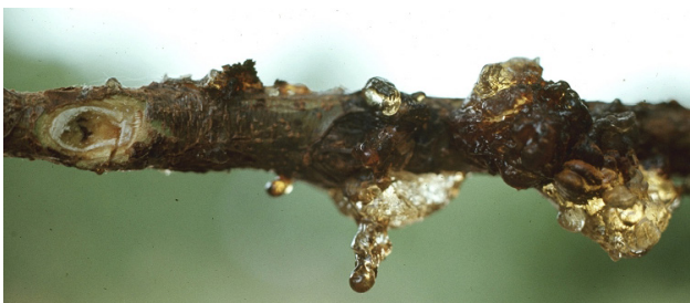
Figure 13. Characteristic gum from damage caused by the lesser peach tree borer

Borer or bacterial canker? Insect borers and the bacteria that cause canker disease both result in sap or gum appearing on the bark or fruit. To identify the cause as borers, look for accumulations of waste and woodchips mixed with the gum (Fig. 13). Cutting into these areas will reveal tunnels and often the white larval stage of the borer.