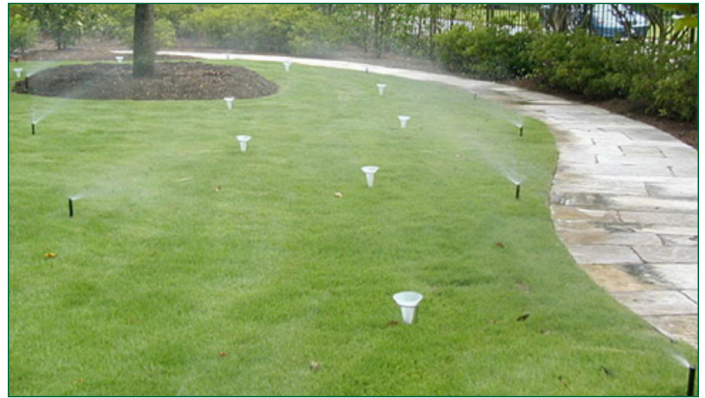
Figure 2. Irrigation audit being performed in a home lawn

Another method, which uses water responsibly, is to use evapotranspiration (ET) rates as a reference point for scheduling irrigation. The Texas ET network ( http://texas-et.tamu.edu ) provides evapotranspiration rates through-