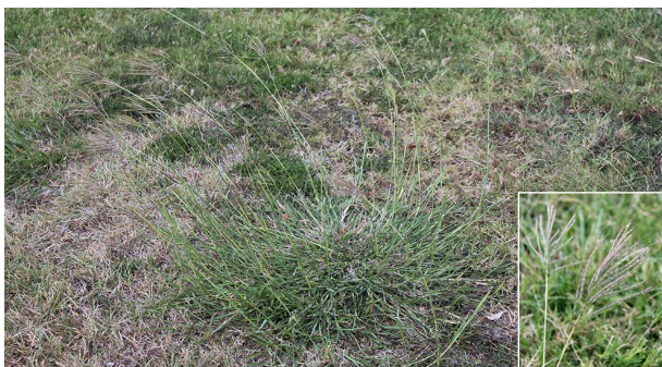
King Ranch ("KR") Bluestem Bothriochloa ischaemum (L.) Keng