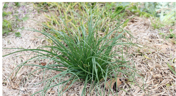
Wild Onion Allium canadense L.