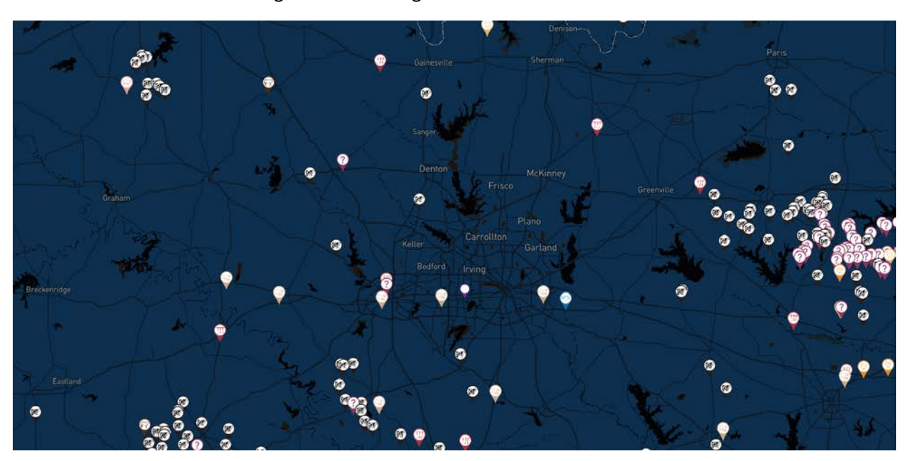
Wise County and surrounding area map on next page

Know your rights in your state. How are drone laws written? What can you do as a private landowner? How can you protect yourself at home against these extremists? Give your elected officials a call and alert them to this serious infringement of our rights.