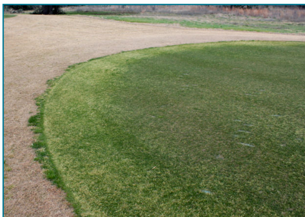
Figure 1. Annual bluegrass on a golf course.

Matt Elmore, Casey Reynolds and Paul Baumann*